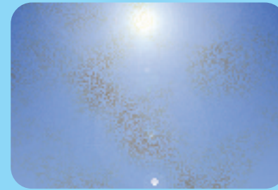
2. Daylight triggers the Pilkington Activ™ coating.