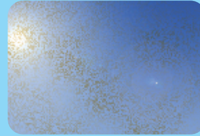
1. The window is exposed to daylight.

Pilkington Activ™ can be identified using a unique hand-held detector on the coated surface, which your installer should have available. Your installer should also provide you with a Pilkington Activ™ installation certificate.