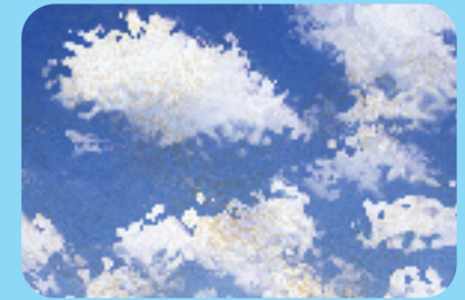
5. Dirt is washed away by rain.