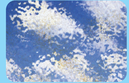
4. Rainwater hits window and sheets down glass.