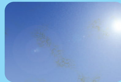
3. Reaction loosens organic dirt.